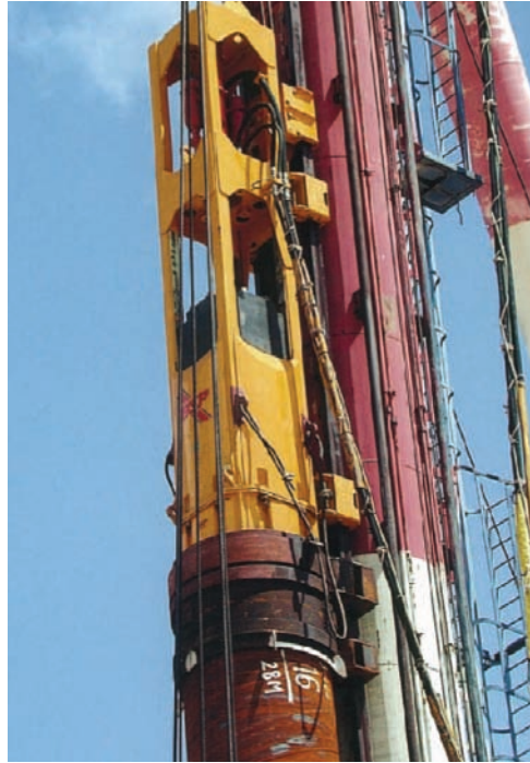
CG300, Leader mounted on a barge, driving steel tube piles