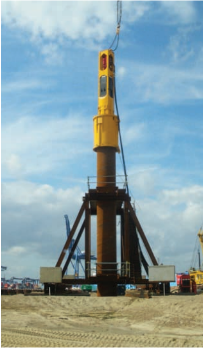
CG240, Crane suspended driving steel tube bearing piles